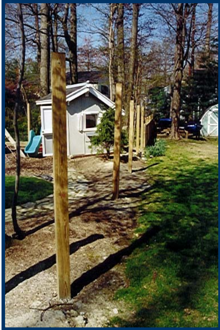
A Photo of a Fence Being Constructed